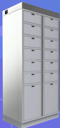
14-Door Mix Use Unit