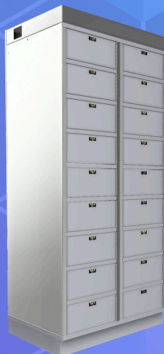
18-Door Mix Use Unit