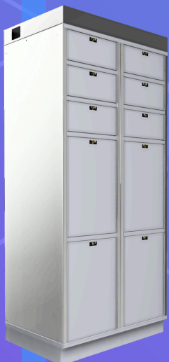
10-Door Mix Use Unit