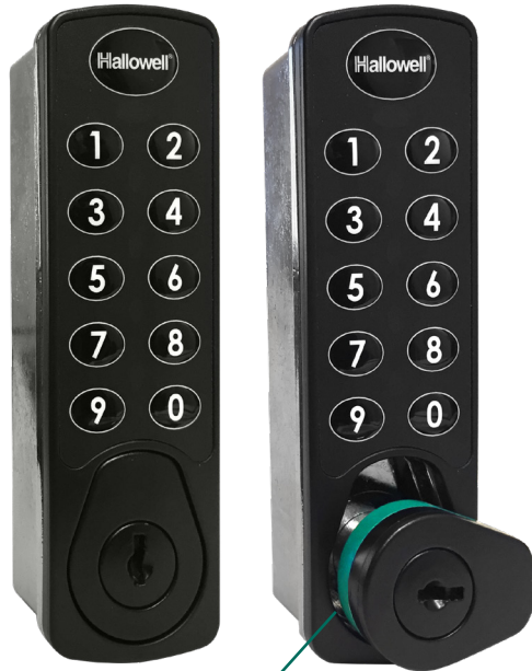
Green indicator ring

Lock does not require a code to re-lock door.